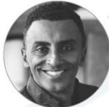
MARCUS SAMUELSSON Award-Winning Chef, Restaurateur, Author and TV Personality