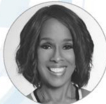
GAYLE KING Co-Host, CBS This Morning and Editor-at-Large, O, the Oprah Magazine