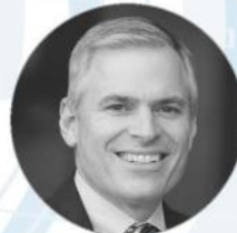
PATRICK LENCIONI Founder, The Table Group